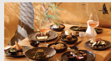
VARIED CULINARY VENUES