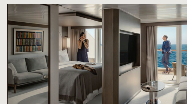
SPACIOUS HOMES AT SEA